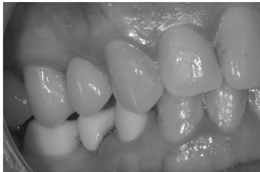
Figure 2 Try-in of the IPS e.max ZirCAD framework.

The minimum connector dimension was 9 mm 2 for both types of restorations, and the frameworks were manufactured with an anatomic form and a minimum thickness of at least 0.5 mm at the axial walls and 1 mm at the functional cusps. The technician verified the thickness of the veneering porcelain at different locations using a digital micrometer, so that the thickness of the veneering porcelain was approximately 1 mm in all areas.