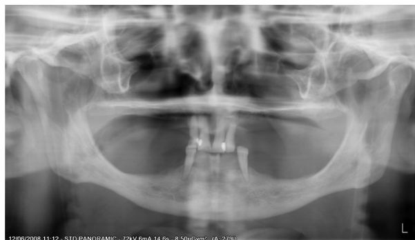
Fig. 1: Orthopantomography of the patient on his first visit.

An orthopantomography (Fig. 1) and Cone Beam Computed Tomography were taken to assess the feasibility of